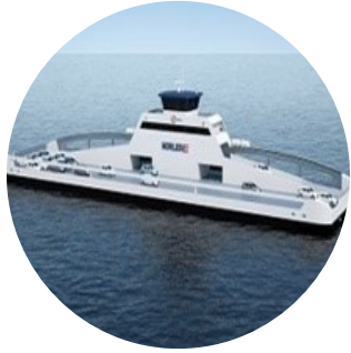
Car and passenger ferries