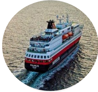
Cruise and Yachts