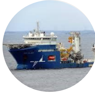
Offshore and subsea