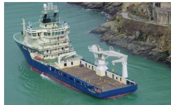
AHC Subsea Winches