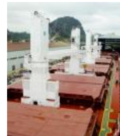
Crane & Winch