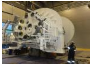
General Purpose Offshore Cranes