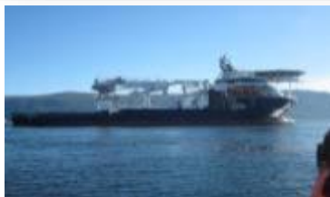
Active Heave Compensated (AHC) Subsea Cranes